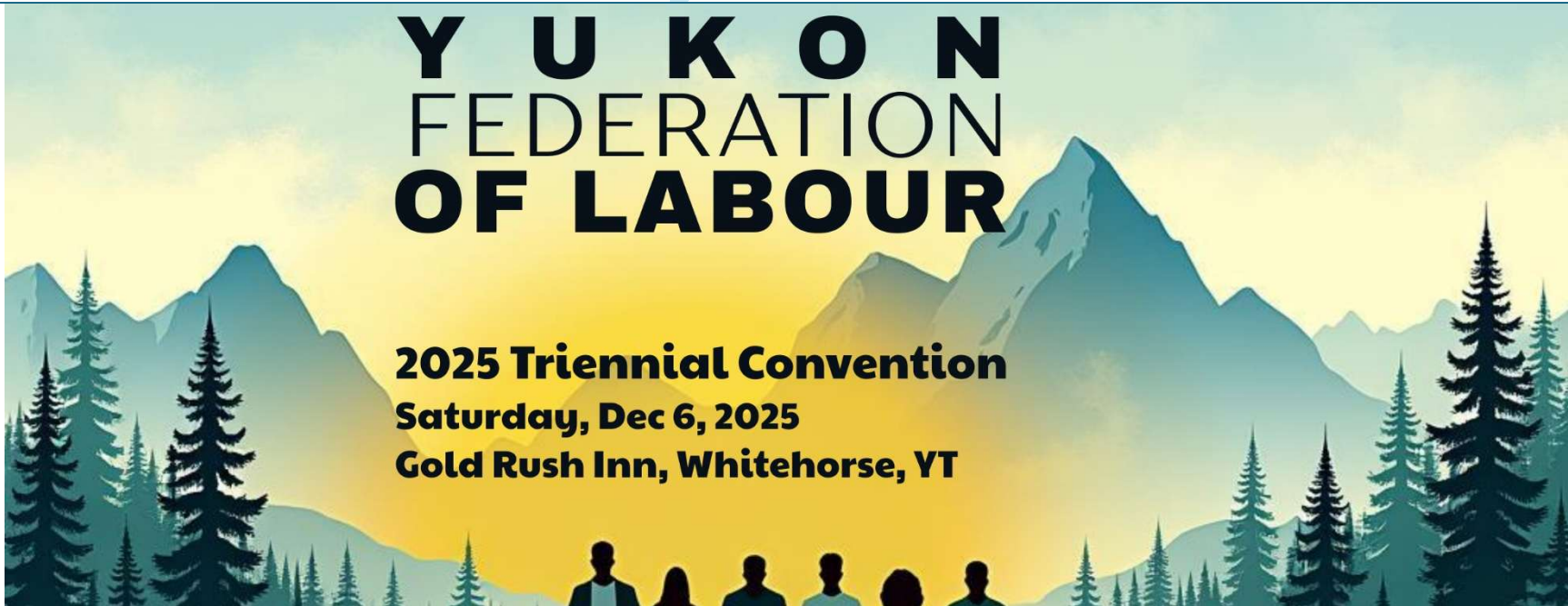
Picture Caption: Yukon Federation of Labour will be celebrating 45 years at the Triennial Convention on December 6, 2025 at the Gold Rush Inn, Whitehorse, Yukon. Registration is now open at https://yukonfed.com/events/convention2025/ .