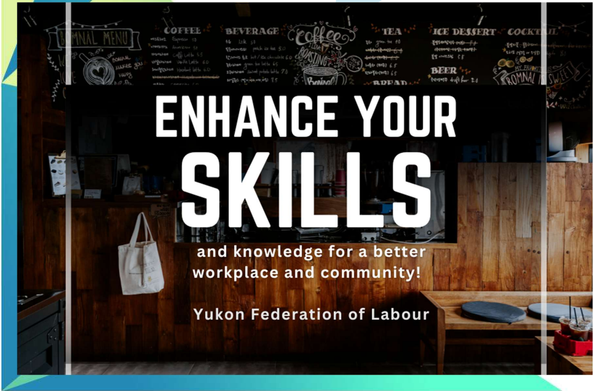
Picture Caption: YFL has offered workshops on Worker Rights, Naloxone Training, Threads of Life, and offered trivia and networking events over the summer. Yukonfed.com/events