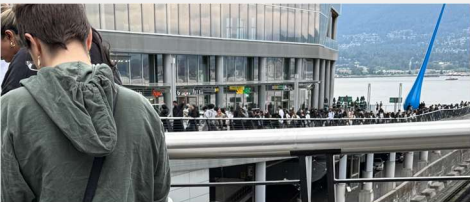
Picture Caption: Students line the YVR pier waiting for job interviews for a new local clothing warehouse, June 2025.