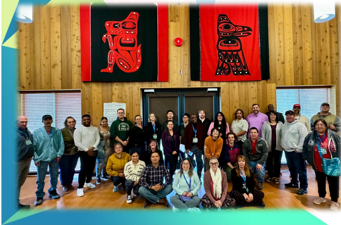
Picture Caption: Students at the 2024 Yukon Union School held in Whitehorse at the Kwanlin Dun Cultural Centre.